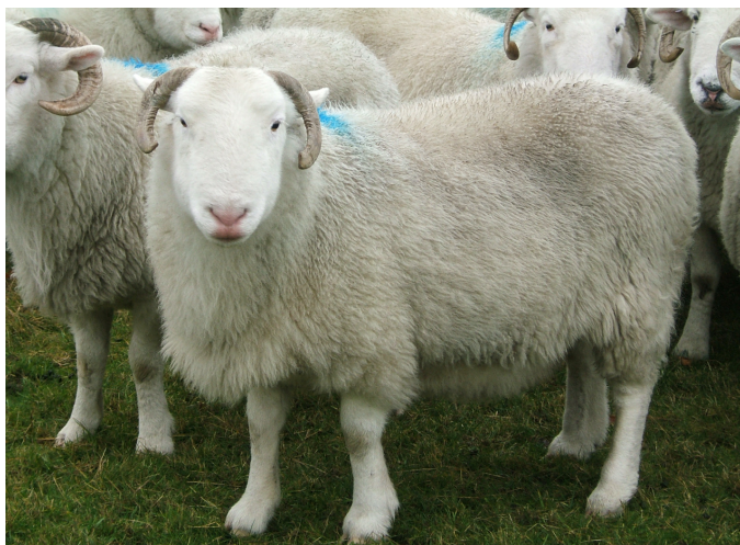
Note the strength of bone in this ewe